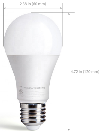
MECHANICAL DIMENSIONS (1:2 SCALE)